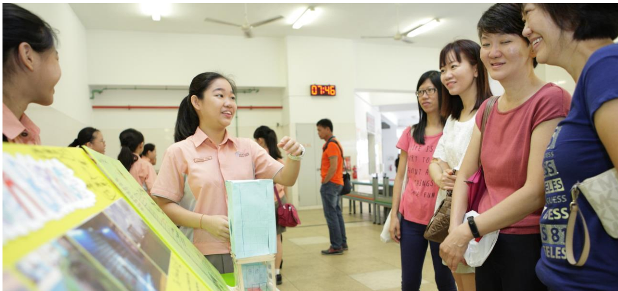
School Captains presenting at Leadership Day

Horizon Primary also conducts a student-led conference, practised from Primary 1 – Primary 6 where students share with parents their learning experiences and how they plan to move forward with their learning efforts. The conference is also aimed to reinforce the 7 Habits such that students can take charge of their own learning.