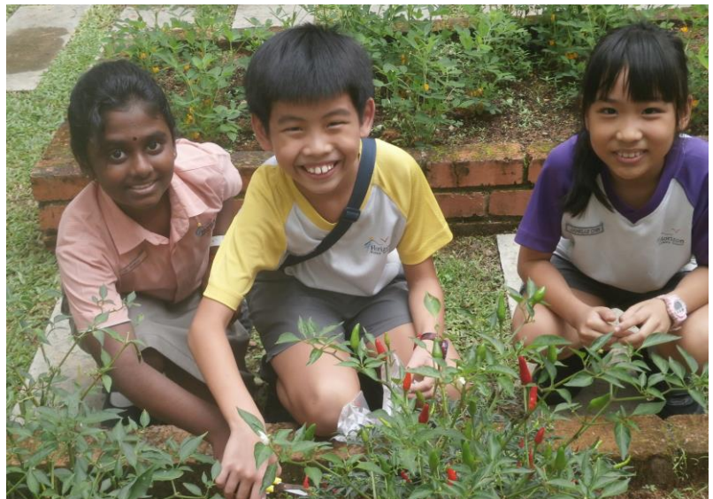
Environment Education through Experiential Learning

The level 2 leadership focuses on developing Primary 3-4 students to be responsible leaders in action. As the students start to be aware of their personal leadership traits, the school structures VIA platforms for students to take actions to impact others. The Buried Treasure in the P3 Curriculum and the Fresh Me Up in the P4 Curriculum allows students to work collaboratively in groups on issues in Environment Education to effect positive changes and environmental awareness.