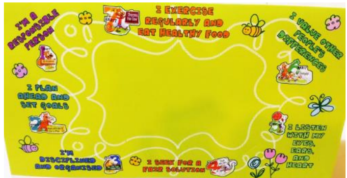
7 Habits Poster in the I-LEAD fun pack

The I-LEAD Student Leadership Programme is conducted weekly using different learning modes which include interactive, experiential, independent and hands-on learning. Students learn the habits through story-telling, role-playing and games. There is even a 7 Habits song to help lower primary students to internalise the habits.